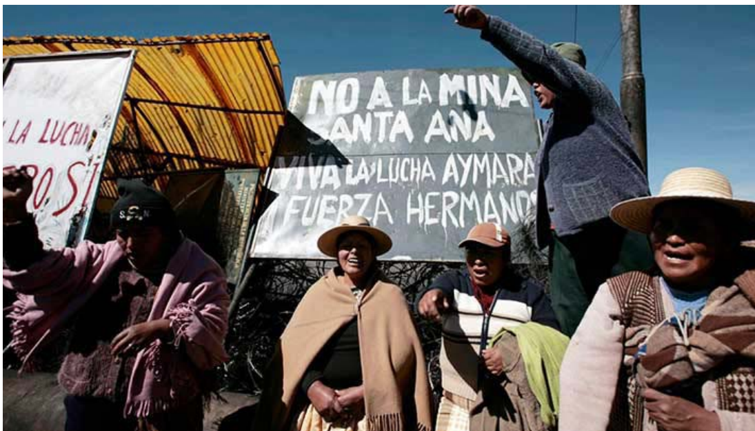
Posted June 9, 2022 In Mining

The case of Bear Creek v. Perú is one such example. In this dispute, Bear Creek, a Canadian mining company, engaged in exploratory work in the Santa Ana mine site in Perú (a rural area bordering Bolivia) that it eventually sought to bring to production. 42 Peruvian law, however, incorporates several legal requirements that a company must undertake prior to exploitation of a mine. For instance, Bear Creek had to reach agreements with all landowners on the mine site to ensure permission for surface land use, 43 and would need several governmental authorizations to develop the mine. 44 Before the company could secure these government authorizations, the law required a complete ESIA for the production or exploitation stage. Only with the approval of an ESIA could the company seek other authorizations required to begin mining operations (e.g., authorizations for water use, transportation, power supply, etc.). 45 Although Bear Creek submitted an ESIA for the project, the government identified several deficiencies preventing its formal approval. 46 In addition, an important element of the ESIA at the time was the requirement of mining developers and government officials to engage in consultations with all affected communities via a “Citizen Participation Plan,” 47 which is a necessary step toward securing community approval to operate. 48