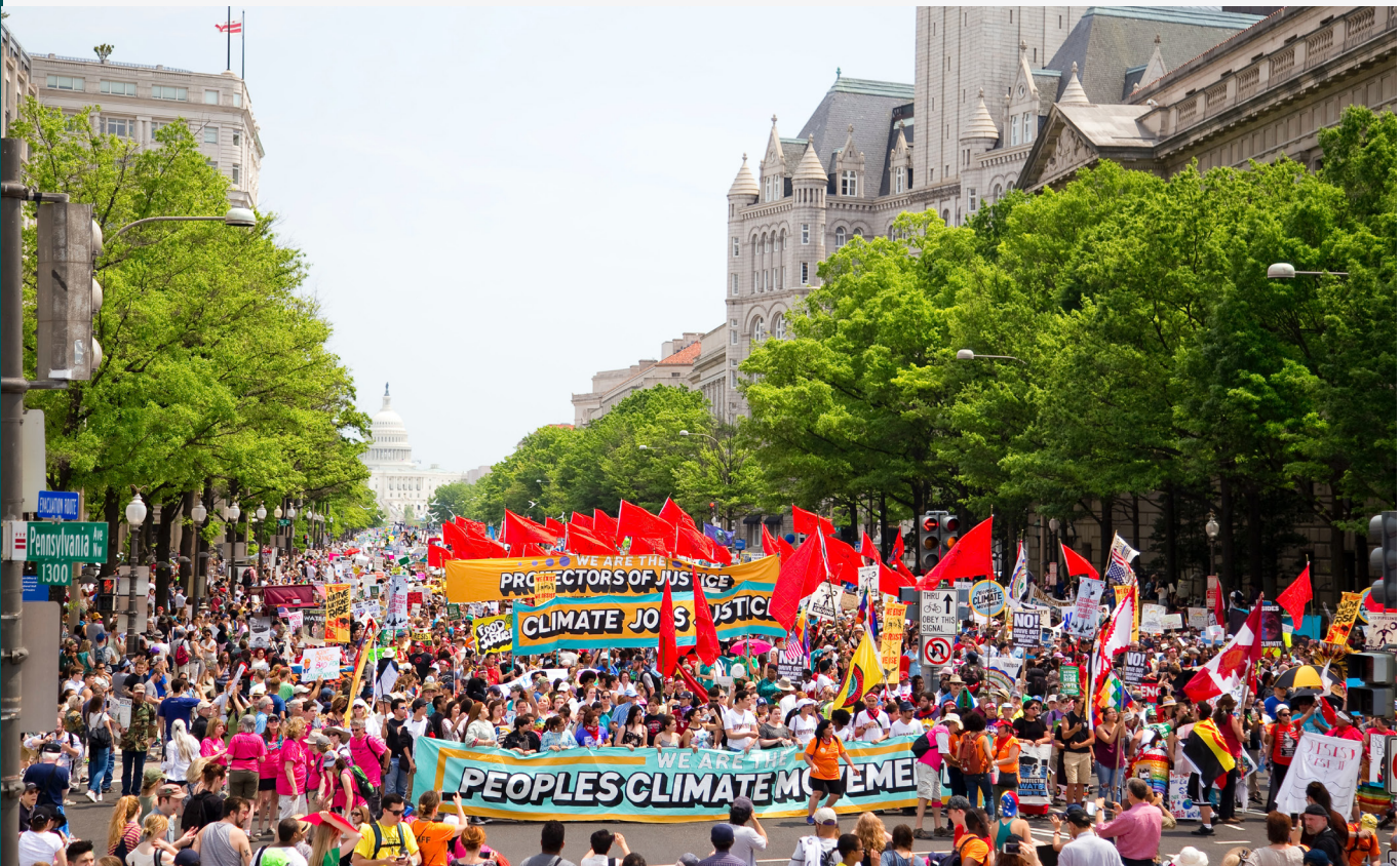
People's Climate March, Washington, United States, 2017.

This is also relevant in relation to human rights impacts related to climate change and biodiversity loss. Addressing climate change and protecting biodiversity are a key priority for many financial institutions. At the same time, as noted above, human rights defenders standing up against environmental destruction – namely environmental, land and Indigenous defenders – are particularly vulnerable to attacks. 6 Environmental, land and Indigenous human rights defenders are often the “last line of defence” against environmental destruction, and are put under threat when other controls have failed. 7 As such, enabling the protection of their rights is crucial to FIs’ efforts to protect the environment and biodiversity and combat climate change.