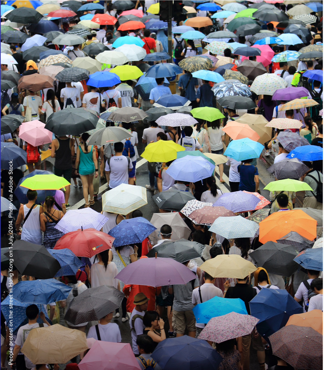
People protest on the street in Hong Kong on 1 July, 2014.

In April 2023 ABN AMRO, APG Asset Management, ING, Robeco and Morningstar Sustainalytics published the paper “ No News is Bad News ” which explores how financial institutions can strengthen human rights assessments of business activities in areas where civic space is restricted. In Spring 2023, Shift held a peer-learning session of its Financial Institutions Practitioners Circle (FIs Circle) to hear more from ABN AMRO and ING about the topics in the paper and to discuss in detail the urgent challenge of addressing impacts on the rights of human rights defenders and the phenomenon of shrinking civic space. This resource captures some of the take-aways from that session, as well as drawing on Shift’s experience working with our partners.