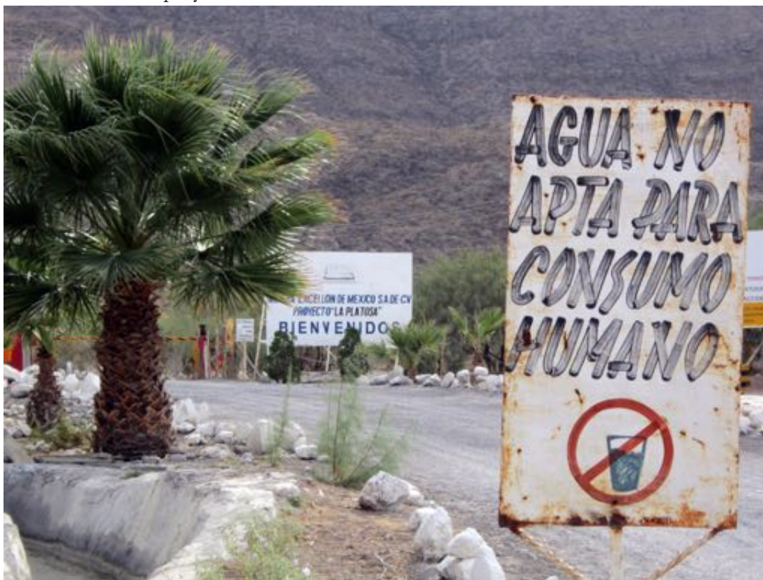
Sign in La Sierrita: “Water Not Fit for Human Consumption”.