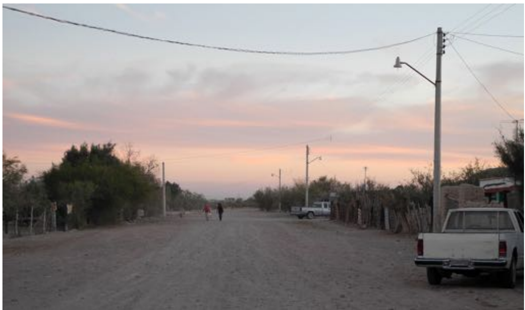
Sunset, Ejido La Sierrita.