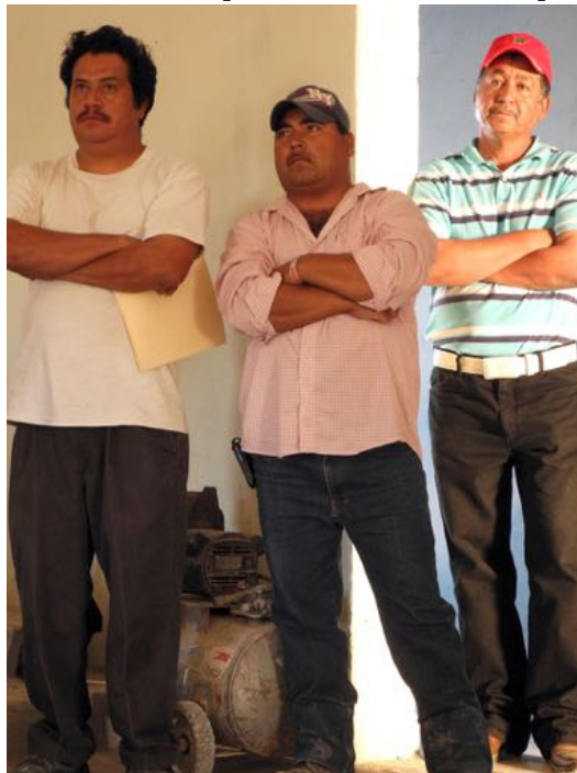
Meeting of Ejido La Sierrita members, December 2012.

Combined with the ineffectiveness of the Canadian CSR Counsellor 48 and the Canadian NCP 49 to provide a helpful response to earlier complaints brought to Canada by the Ejido and union members, and the subsequent, anticipated failure of the Mexican NCP to do the same, these documents provide clear and troubling insights into how Canada is complicit in helping to uphold the state of impunity in which mining companies are operating in Mexico, which leaves communities and workers with few, if any, effective channels to have their grievances meaningfully addressed. They further illustrate how the Embassy’s support of Canadian mining companies serves to enable the sort of arrogant and abu-