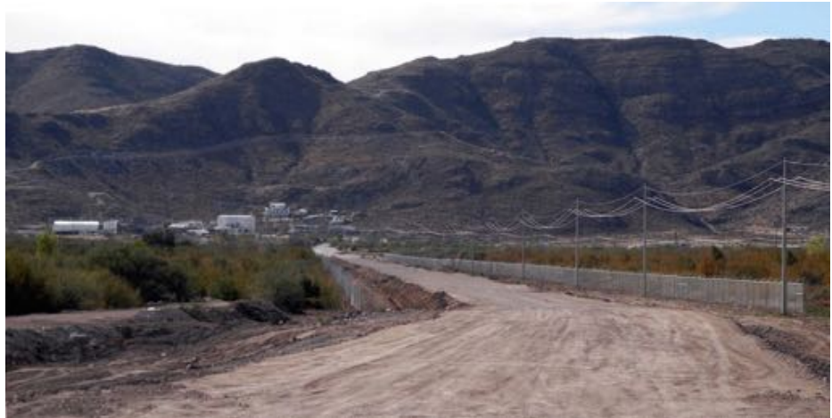
View of La Platosa mine.

The results of our analysis in this report reinforce our concern that Canadian missions abroad are promoting and protecting the interests of Canadian mining companies to the detriment of the individual and collective rights of affected communities. In this case, the