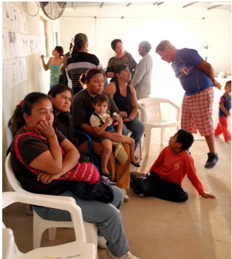
Meeting of Ejido La Sierrita members, December 2012.

The Embassy also played a key role in forging relationships between Excellon and state government officials in Durango, in a similar fashion to what DFA-TD documents have previously revealed about how the Canadian Embassy applied diplomatic pressure at the state level to support Blackfire Exploration's operations