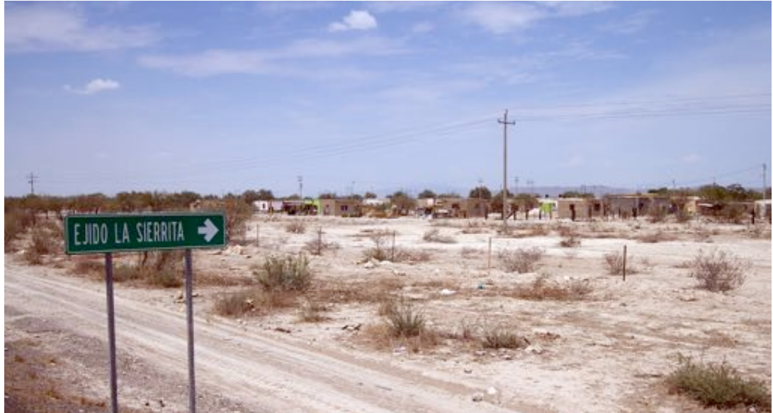
Ejido La Sierrita.

Our assessment of the documents obtained from DFATD leads us to conclude that, contrary to Canadian Government assertions that it promotes responsible behaviour from Canadian mining companies, the Canadian Embassy supported Excellon, despite detailed knowledge about serious human rights violations, prioritizing the short-term commercial interests of this small Canadian mining company over the wellbeing and rights of workers and the community.