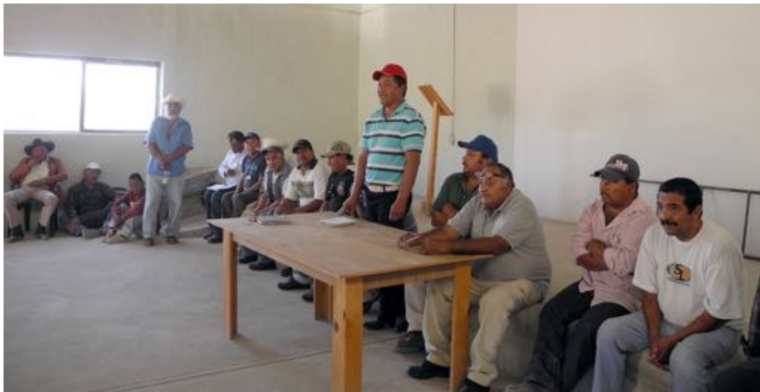
Meeting of Ejido La Sierrita members, December 2012.

One month later, on October 24, the Embassy received an urgent message from ProDESC that a group of mine union members from another part of Mexico,