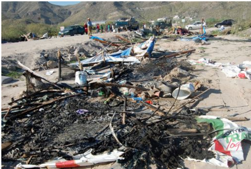
Aftermath of the October 24, 2012 attack on the Ejido La Sierrita protest camp.